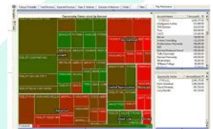
Sales Executive Performance